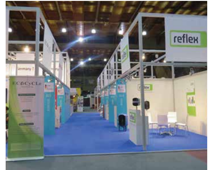
conferences & e xhibitions