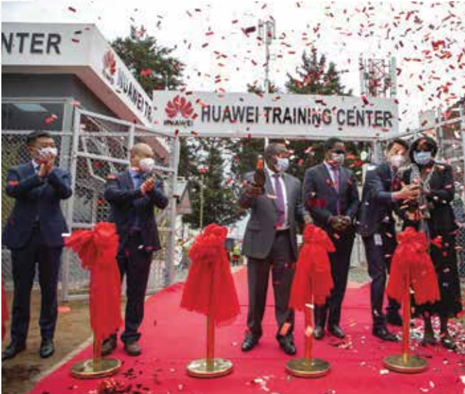
why i vents