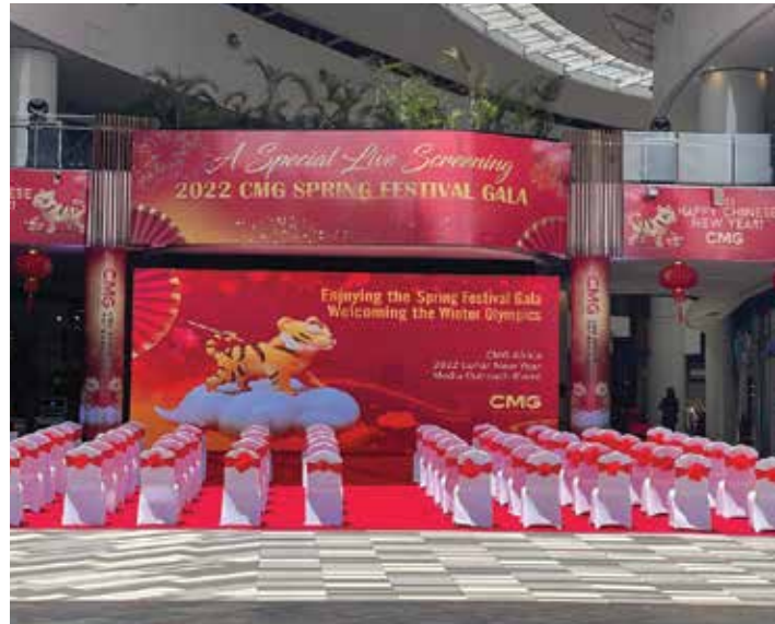
printing n branding